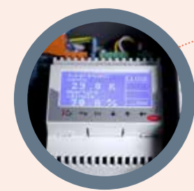
ELECTRONIC EXPANSION VALVE